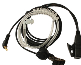
Wired Ear Mic